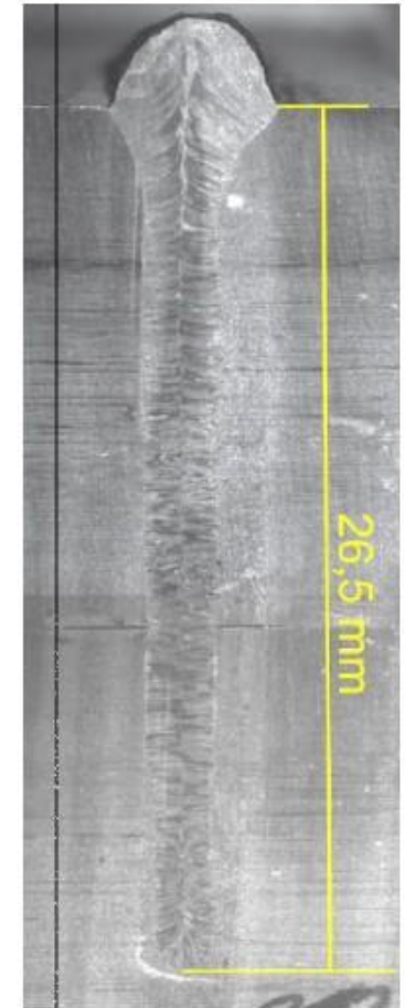
搭接焊接 2x 15 mm 20kW 不鏽鋼 1.4301