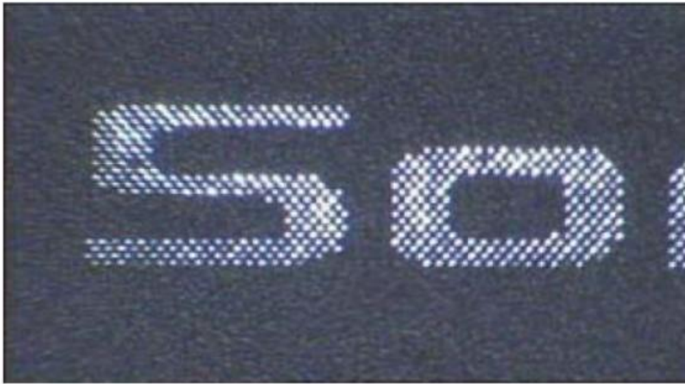
0.2mm thick 1000 Al alloy; 30 \mu m dia